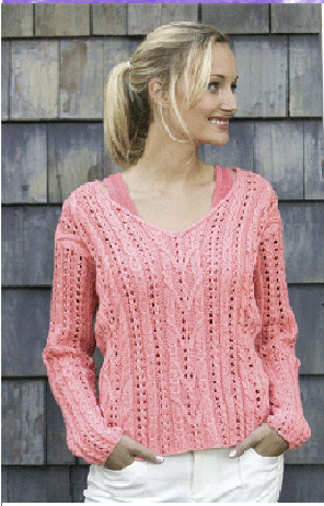
Lacy Cabled Summer Sweater done in Classic Elite Provence